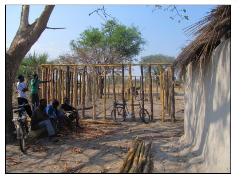
2. In Mabumbu, beneficiaries used traditional techniques to construct a building that can be used for storage of food when it rains and for community meetings.