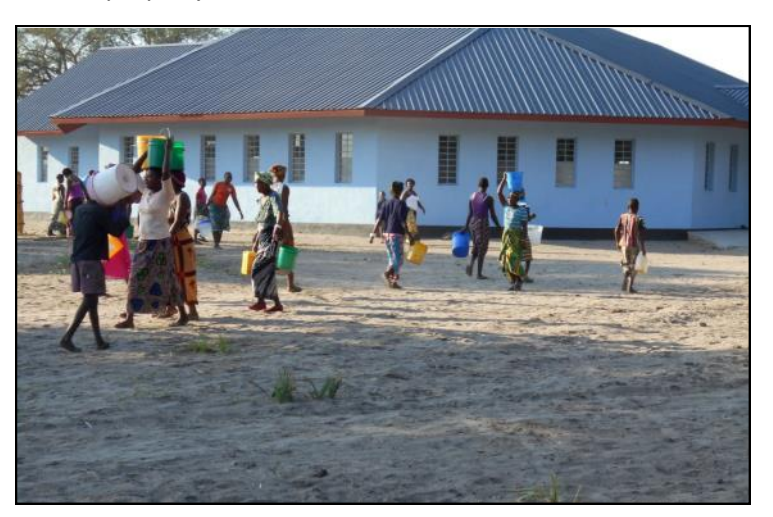
5. Also in Mwandi, people carried water from the river to moisten clay on the roads so that they could pack it down and repair it.