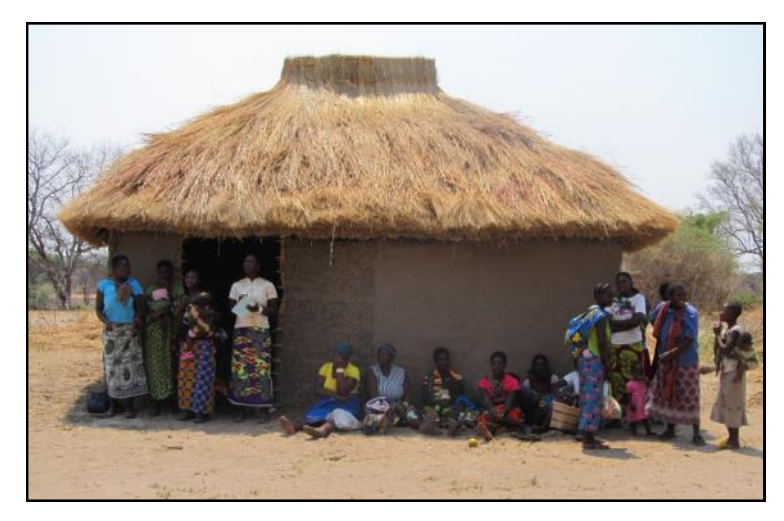
6. In Loanja, beneficiaries built a new storage building.

We are thankful for the opportunity we had to complete this project and have enjoyed the expressions of pleasure as the beneficiaries have received their food.