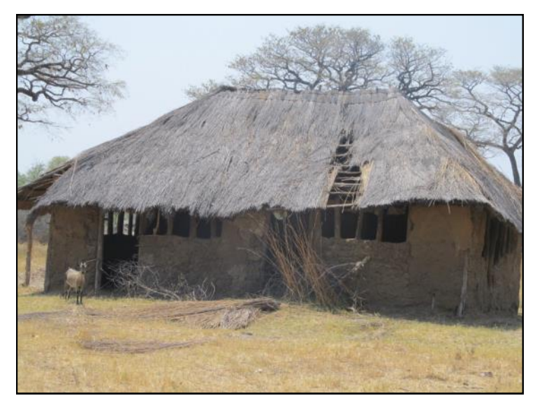
3. In Lutaba, beneficiaries will repair the roof on this building used for the school feeding program.