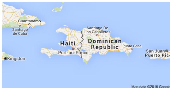
Haiti and the Dominican Republic: a divided island needing assistance

Food and shelter for deportees are priorities for the Haitian government and the humanitarian community. For this reason, World Renew wants to support deported Haitians and non-Haitian citizens to have a safe and dignified arrival to Haiti. Because of an influx in migrants and deportees, this situation is becoming an alarming humanitarian crisis. It is an emergency with large numbers of repatriated people returning to their communities of origin, seeking housing and work. Food and water become scarce due to an increase in population. Prior to this situation Haiti was already facing a food security crisis.