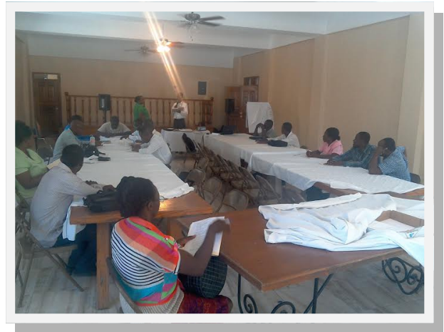
Training session held in MCD's conference room

Christian Reformed World Missions is partnering with Timothy Leadership Training International (TLTI) to implement a training program designed to encourage Haitians to reflect on the characteristics of those who can be good leaders. The purpose of this bible-based training program is to help churches and communities discern who among them have the gifts and calling for leadership. The program teaches participants about the importance of making wise choices; not only in elections but also in churches, schools and communities.